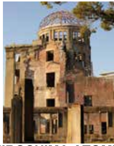
HIROSHIMA ATOMIC BOMB DOME

Today experience the Shinkansen - (Famously known as Bullet Train) from Osaka to Hiroshima, running at speed of up to 300 km/h and known for its punctuality. Hiroshima is a modern city on Japan's Honshu Island which was largely destroyed by an atomic bomb during World War II. On arrival we will proceed to Miyajima Island via Ferry and we will visit the Itsukushima Shrine, best known for its "floating" torii gate. Also visit the Peace Memorial. In the evening return to Osaka for Overnight stay.