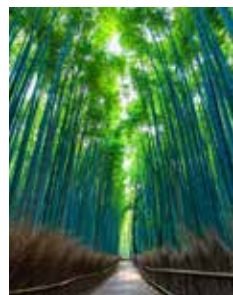
ARASHIYAMA BAMBOO FOREST

Once the capital of Japan, Kyoto is famous for its numerous classical Buddhist temples, gardens, imperial palaces, shrines and traditional wooden houses. Visit Kiyomizu Temple which is an independent Buddhist temple in eastern Kyoto. Later cover the Ninenzaka and Sannenzaka a charming pedestrian path known for its classic architecture, teahouses & cherry blossoms. Post Lunch visit the bamboo forest, and Groves in Arashiyama Area. Also visit the Fushimi Inari Shrine which has thousands of Torii gates and is an important Shinto shrine in Japan. Overnight at Osaka.