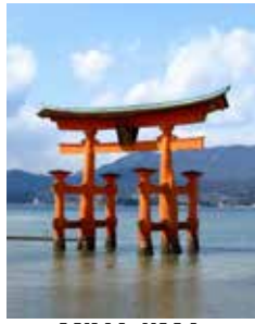
MIYAJIMA TORI GATE