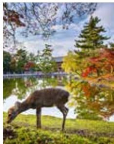
NARA DEER PARK

Today we checkout from the hotel and depart for Nara and visit Nara Deer Park and Todaiji Temple. You can have an experience to dress in an authentic Kimono and learn the history and traditions behind this iconic clothing. Later we will check in to the hotel in Kyoto for overnight stay.