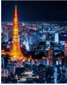
TOKYO CITY SCAPE