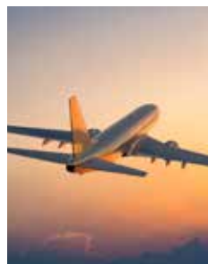
FLY BACK HOME