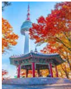
N Seoul Tower

Breakfast. Visit N Seoul Tower. Post Lunch continue to visit Nami Island and later free time for Shopping at Lotte Tower. Dinner and Back to Hotel.