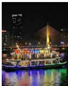
HAN RIVER CRUISE

After breakfast checkout from the hotel and transfer to the airport for your flight to Seoul. Arrive Seoul and transfer to Hotel. Evening Proceed for Han River Cruise. Dinner and Back to Hotel