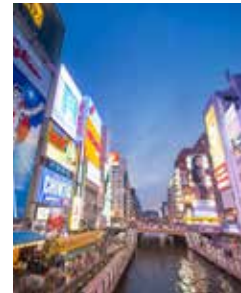
DOTONBORI & SHINSAIBASHI