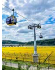
Seoul City Night Skyline

After Breakfast proceed to Gyeongbokgung Palace to see the Changing of Guards Ceremony. Later drive to DMZ and enjoy Cable Car + Freedom Bridge, Unity Bell etc. Post Lunch return back to Seoul to visit Jogyesha Temple and Insadong Street. Dinner and Back to Hotel