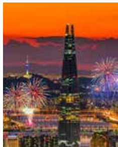
Kiyomizu-dera Temple Kyoto