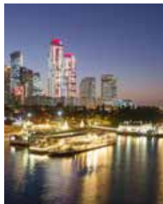
Dotonbori Osaka Street Scene

After breakfast checkout from the hotel and transfer to the airport for your flight to Seoul. Arrive Seoul and transfer to Hotel. Evening Proceed for Han River Cruise. Dinner and Back to Hotel