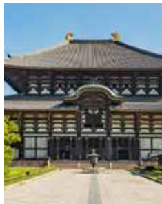
Mount Fuji Scenic View