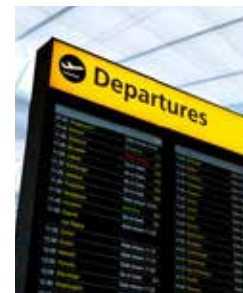
Third Infiltration Tunnel DMZ