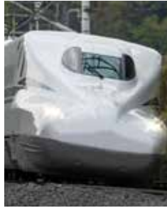
Hiroshima Atomic Bomb Dome