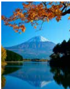
Cherry Blossom Festival Japan