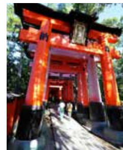
Itsukushima Shrine Torii Gate