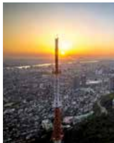
Gyeongbokgung Palace Seoul