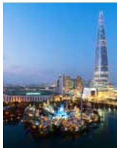
Dongdaemun Design Plaza Seoul

Breakfast. Visit N Seoul Tower. Post Lunch continue to visit Nami Island and later free time for Shopping at Lotte Tower. Dinner and Back to Hotel.