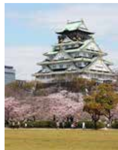
Kyoto Historic Street View

Today, proceed for a guided city tour. Start your visit to Osaka Castle, one of Japan's most famous landmarks and it played a major role in the unification of Japan during the sixteenth century. Next visit the Floating Garden Observatory at Umeda Sky Building, where Osaka's cityscape can be viewed from a height of 170 meters. Rest of the day have free time for shopping at Dotonbori and Shinsaibashi. Overnight in Osaka.