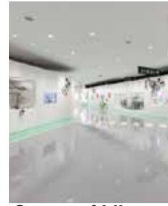
Statue of Liberty Odaiba Tokyo