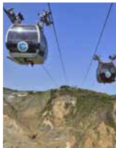
Tokyo Imperial Palace Moat

Today enjoy a dynamic tour of Mt. Fuji and Hakone. Mt. Fuji is an active volcano about 100 kilometers southwest of Tokyo. Commonly called "Fuji-san," it's the country's tallest peak, at 3,776 meters. Drive to the highest point in the mountain that a bus can drive in to the 5th Station (Weather Permitting). Later enjoy the sweeping views from Hakone Sky Gondola and Pirate Boat on Lake Ashi will surely remain memorable. In the evening return to Tokyo for the overnight stay.