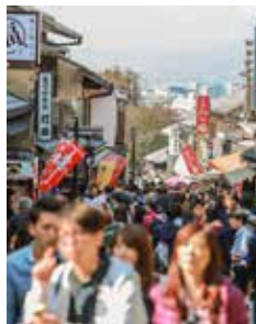
Mount Fuji Ropeway View

Today we checkout from the hotel and depart for Nara and visit Nara Deer Park and Todaiji Temple. You can have an experience to dress in an authentic Kimono and learn the history and traditions behind this iconic clothing. Later we will check in to the hotel in Kyoto for overnight stay.