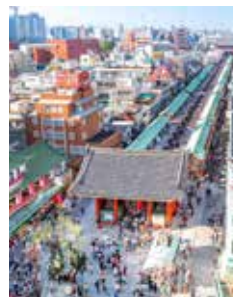
Akihabara Tokyo Cityscape

Tokyo City tour - Visit the Imperial Palace (Primary residence of the Emperor of Japan). Next visit the tallest structure in Japan to enjoy views of sprawling Tokyo city from the towering observation deck of TOKYO SKYTREE. Later visit the Asakusa Sensoji Temple which is an ancient Buddhist temple and have some free time at Nakamise Shopping Arcade where you can walk around the local stores or try famous street food of Japan. Post Lunch it's time to discover the incredible Team Lab Planets – an art facility that utilizes digital technology to create illusions. Here you walk through water, and a garden where you become one with the flowers. It comprises 4 large-scale artworkspaces and 2 gardens. Overnight in Tokyo.