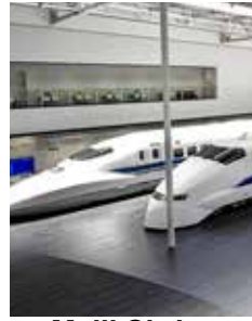
Meiji Shrine Tokyo

After breakfast, check out from the hotel and board a bullet train to Nagoya, Japan's fourth-largest city and a major manufacturing hub. Upon arrival, visit the Toyota Commemorative Museum of Industry and Technology to explore historic Toyota models, followed by the SC Maglev and Railway Park, where you'll see high-speed trains including Shinkansen and Maglev. Later, enjoy a photo stop at Nagoya TV Tower (Mirai Tower), Oasis 21, and the @NAGOYA sign, before dinner and hotel check-in in Nagoya.